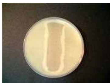
Pseudomonas aeruginosa ATCC 27853