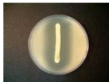
Staphylococcus aureus ATCC 25923