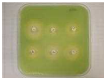
Pseudomonas aeruginosa ATCC 27853