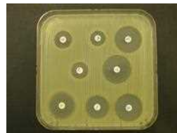
Escherichia coli ATCC 25922