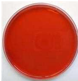
Uninoculated Plate (Control)