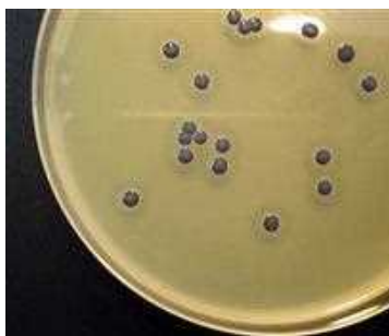
Staphylococcus aureus ATCC 25923 (Lecithinase Halos)